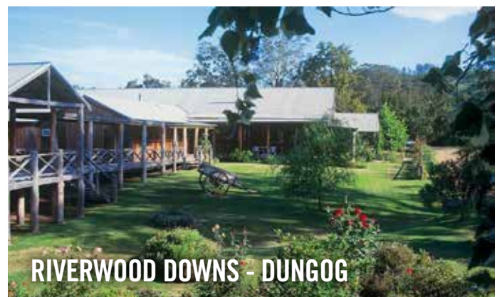
RIVERWOOD DOWNS - DUNGOG